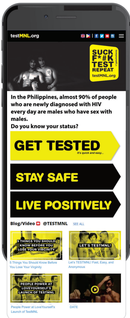
mobile interface of TestXXX website's homepage TestXXX websites are responsive to every devices: desktop, mobile and tablet.

Developing the Campaign Products and Touchpoints: A campaign website is the campaign's core product that serves as an information gateway to provide YMSM with knowledge relating to HIV, including where to get tested, how to remain HIV-negative, and how to live a healthy life if tested positive. The website content is presented in at least two different languages: the lingua franca of the target audience and English language. The use of technical jargon in the website is kept to a minimum, while the interface is engineered to keep the website's bounce rate as low as possible. Along with the website, the CIP produces campaign videos that deliver the developed key messages and generate the traffic to the website. Marketing items such as leaflet, poster, and memorabilia also serve as other touchpoints that yield traffic to the website.