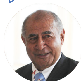
Pacific Ambassador H.E. Ratu Epeli Nailatikau