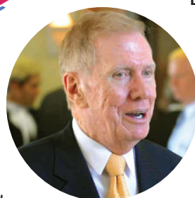
LGBTI Human Rights Ambassador The Hon Michael Kirby